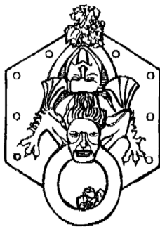
Door knocker of St. Nicholas